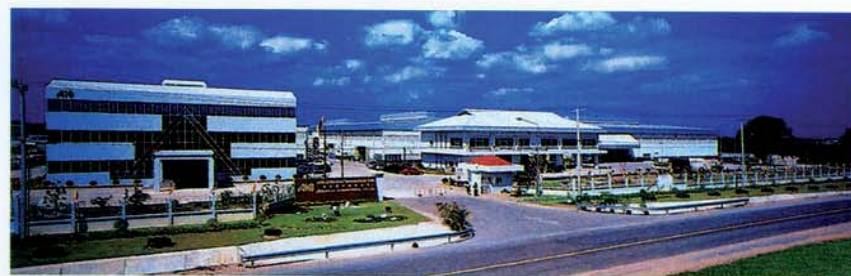
AEROFLEX INTERNATIONAL CO., LTD. HEAD OFFICE & FACTORY, RAYONG, THAILAND