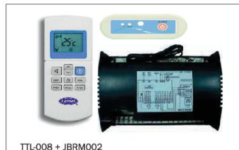
TTL-008 + JBRM002